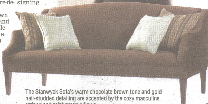
The Stanwyck Sofa's warm chocolate brown tone and gold nail-studded detailing are accented by the cozy masculine striped and mint green pillows.

elongate a piece's life. I've worked with top Canadian furniture suppliers, Korson Furniture Design and Statum Designs Inc. for many years, sourcing and designing custom pieces for my clients and I trust them. This is why I chose to work with them, to create a Canadian line where the majority of the money will be put back into the Canadian economy, specifically in materials and labour. Making it domestic also means a drastically shorter